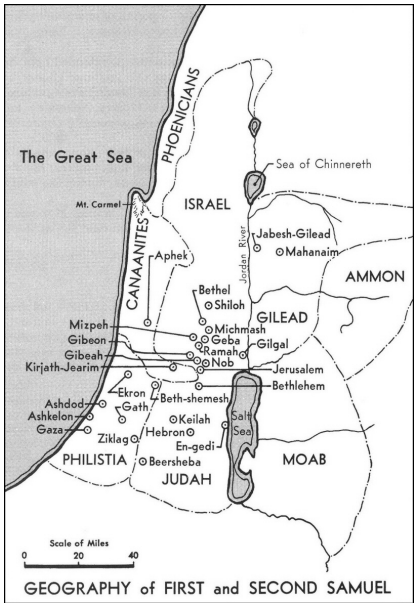
Map of David's Kingdom-ESV Global